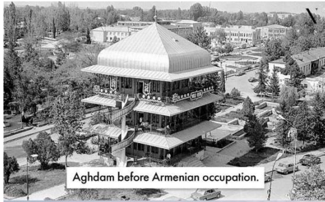
Aghdam before Armenian occupation.