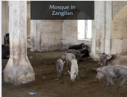
in Zangilan it was turned into a hoggerly

And these are the photographs of the mosques -