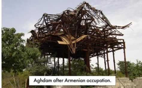
Aghdam after Armenian occupation.